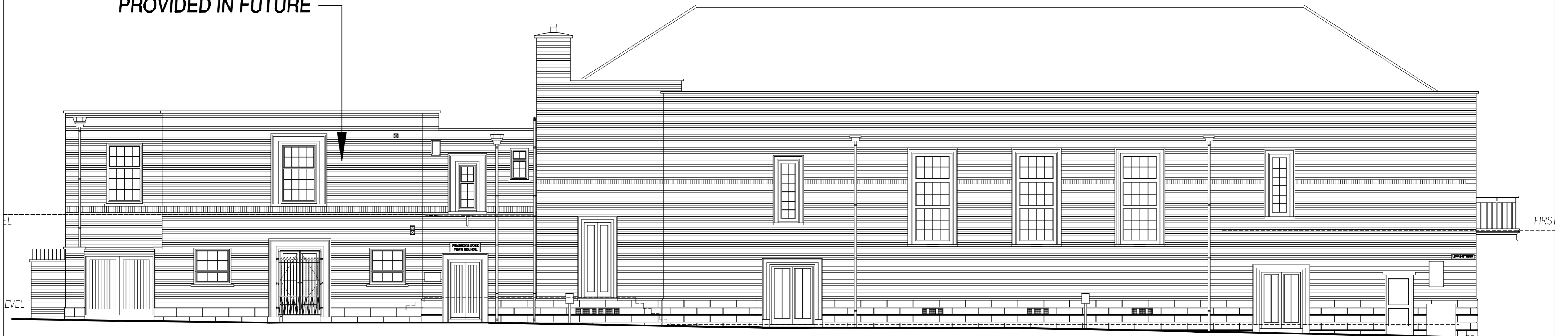
EXISTING SIDE ELEVATION (LEWIS STREET) 1:100

FUTURE - PHASE 2 WORKS TO REAR OF BUILDING - DETAILED DRAWINGS TO BE PROVIDED IN FUTURE